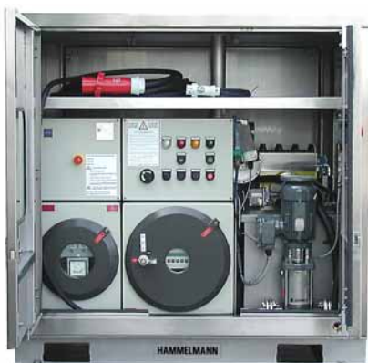
Ex-proof Zone 1 control cabinet